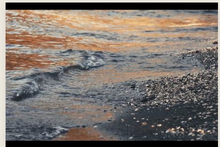
Stills from The Next Chapter.